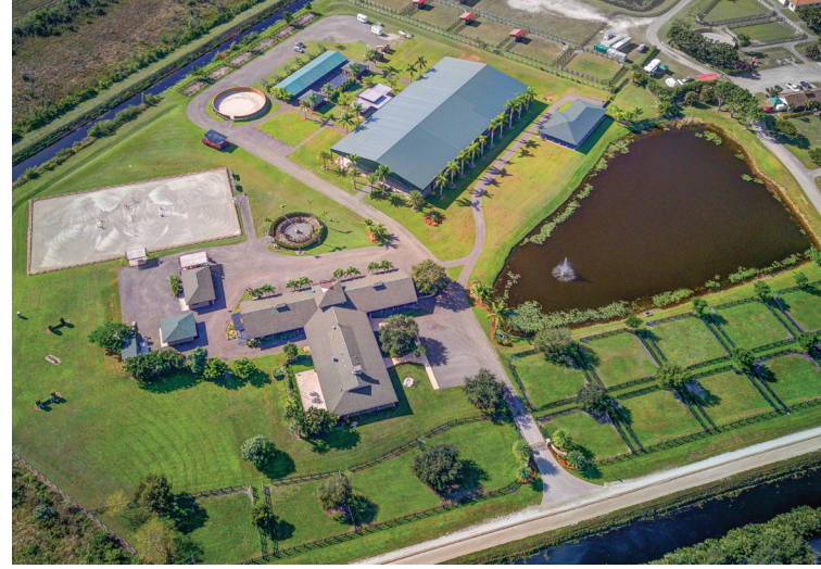
PROFESSIONAL EQUESTRIAN FACILITY | $9,650,000

wide Chicago brick aisles and tongue-and-groove ceiling | automated fly spray footing | outdoor all-weather arena | 42 stalls and 18 spacious paddocks | walker system | 24 total stalls and expansive paddocks | 4 bedroom, 4 bathroom home and round pen | 3 bedroom, 2.5 bathroom main home | 1 bedroom, 1 bathroom marble flooring, vaulted ceilings, and gourmet kitchen spacious travertine tile caretaker home with numerous staff quarters overlooks a pristine lake with outdoor pool area